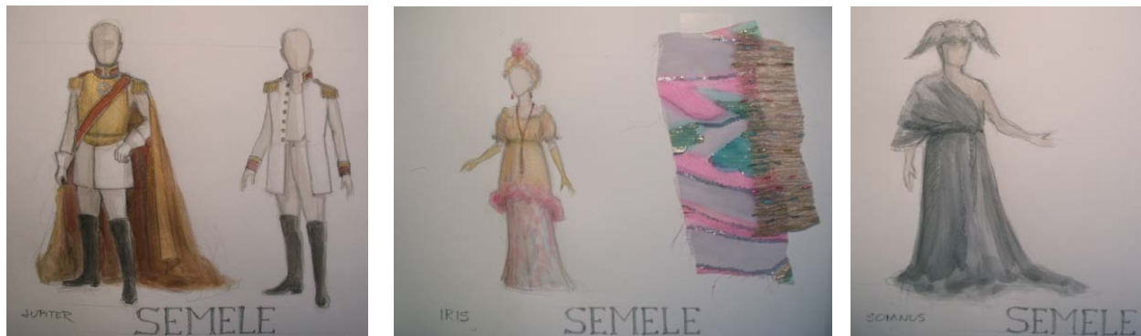
Costume sketches for Jupiter (left), Iris (right), and Somnus (right)