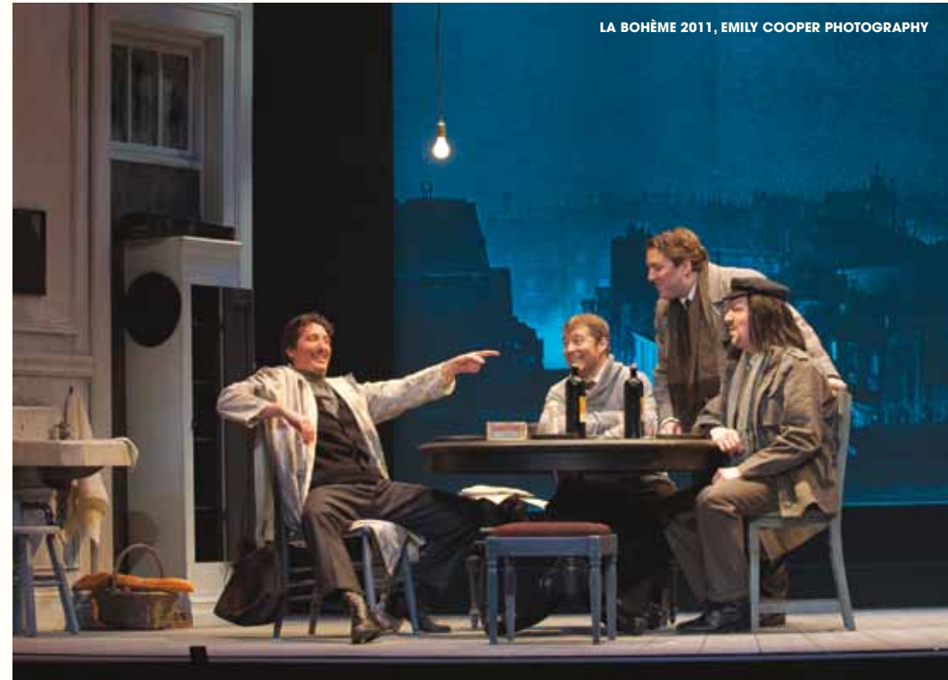
LA BOHÈME 2011