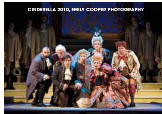
CINDERELLA 2010