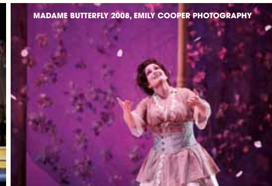
MADAME BUTTERFLY 2008