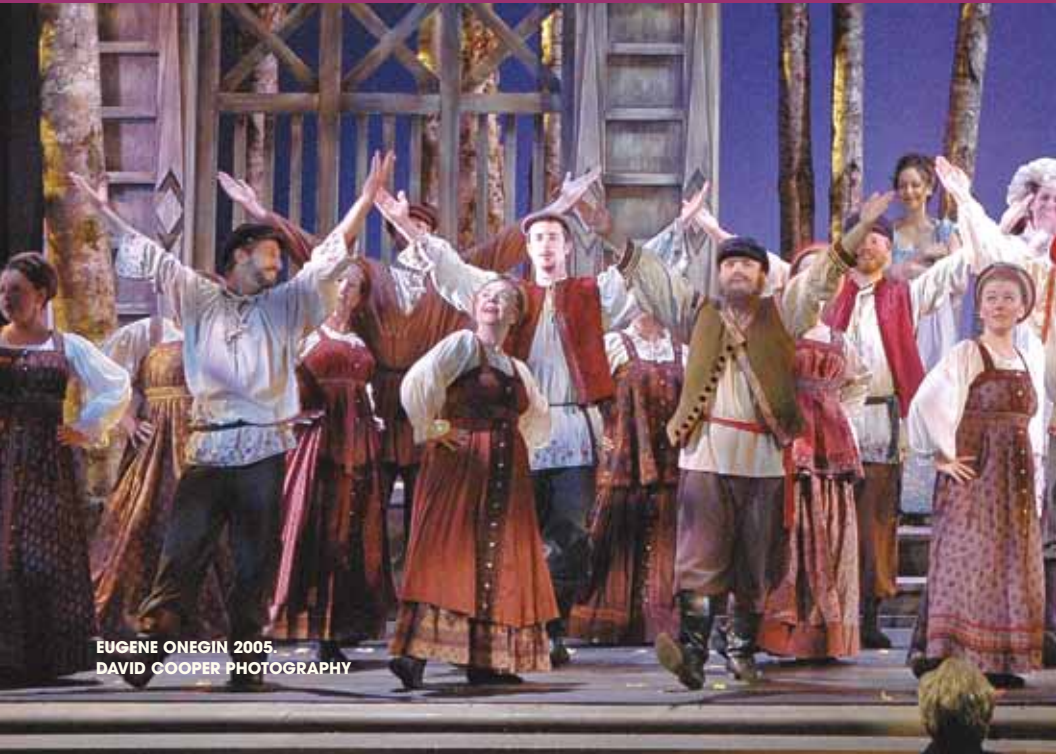
EUGENE ONEGIN 2005.

The Bravo Society is generously supported by